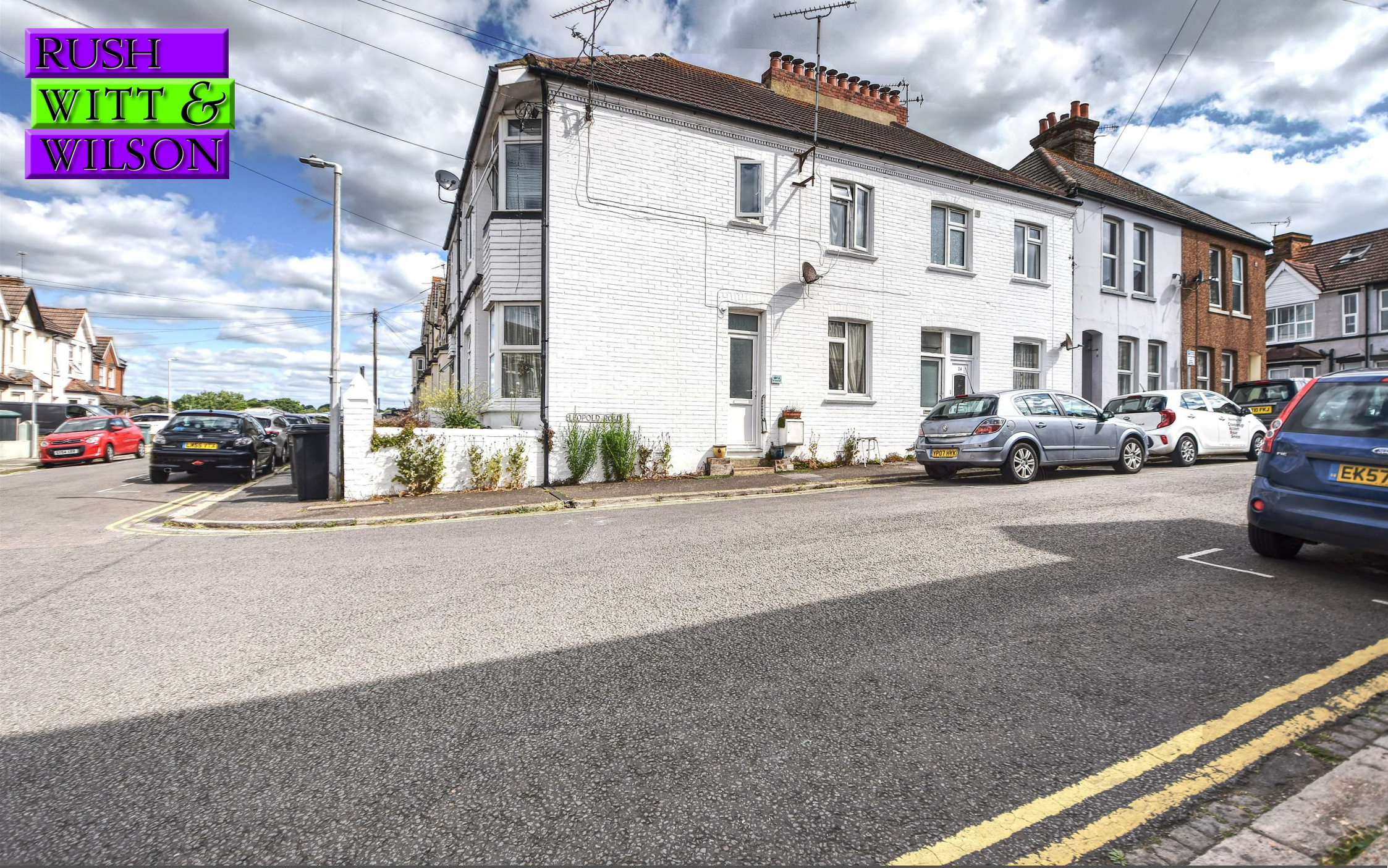
Flat 4 26 Leopold Road, Bexhill-On-Sea, East Sussex TN39 3PF £99,950